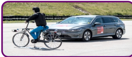
Autonomous Emergency Braking