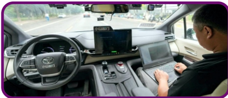
Autonomous Vehicle Testing